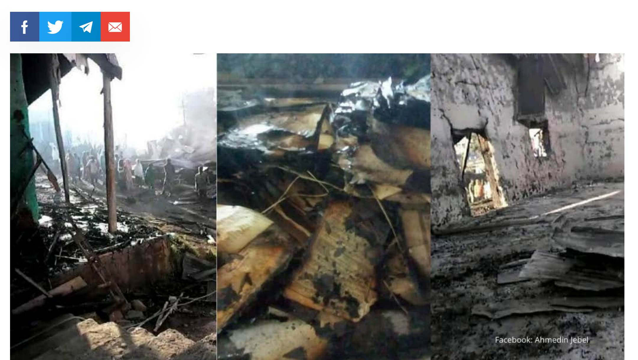
Partial view of a burned mosque in Mota as was posted by Ahmedin Jebel.