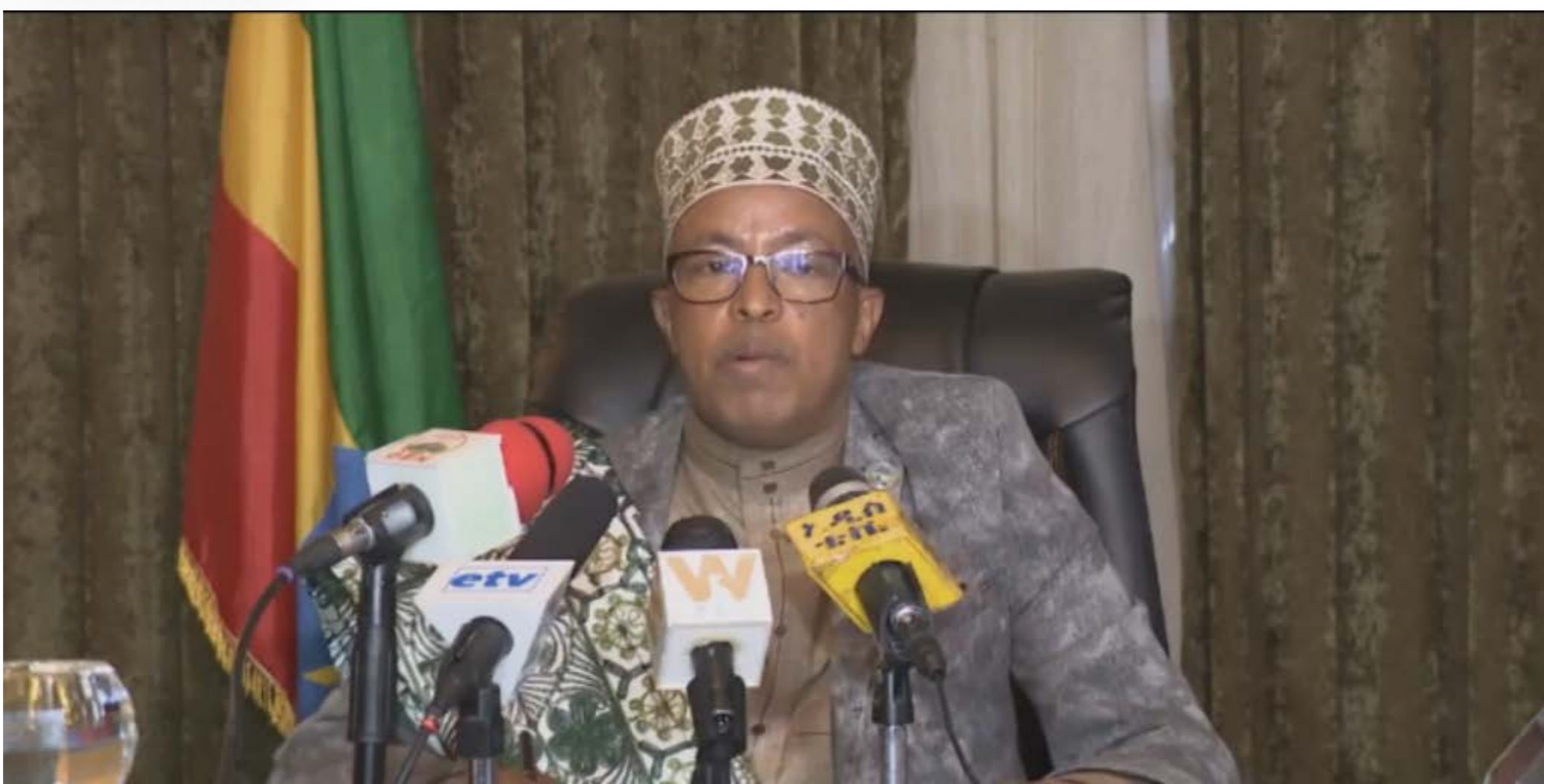
"This is a tragic incident; it's also a grave crime. We strongly caution for those responsible to face the law" Sheik Mohammed Amin