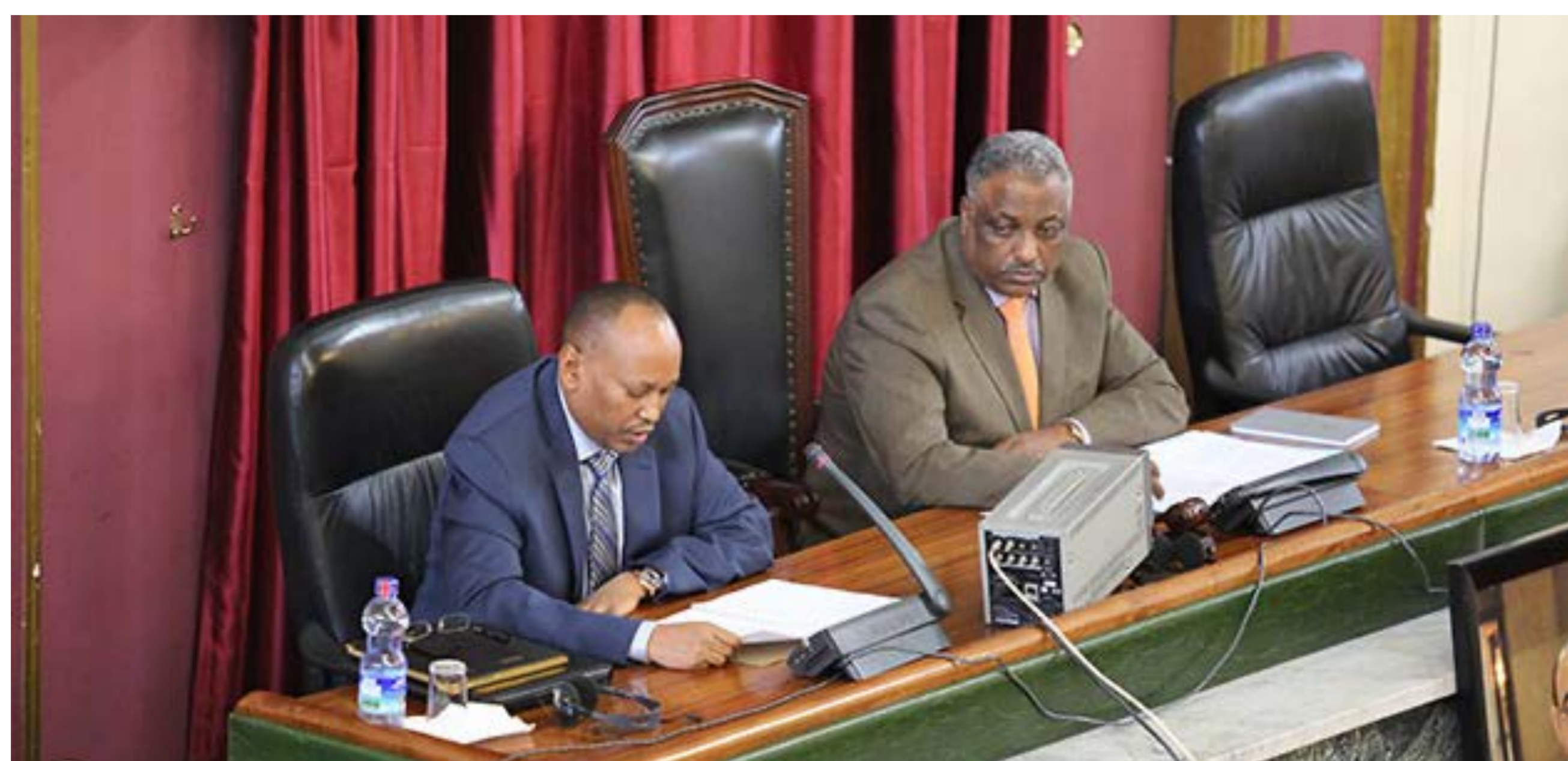
Politics - Commission presents long-awaited Oromia, Amhara protests report