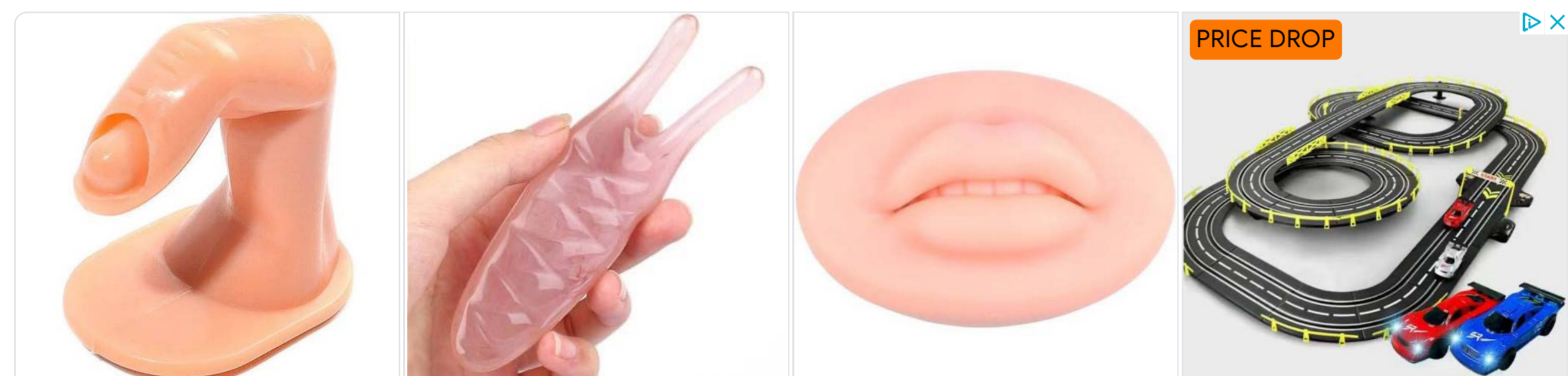
Shopping revolution on Temu

The Commission also said that the protests in Oromia were caused by lack of good governance, human right violations by security forces at zonal and wereda level, and the escalating unfair justice system in the region.