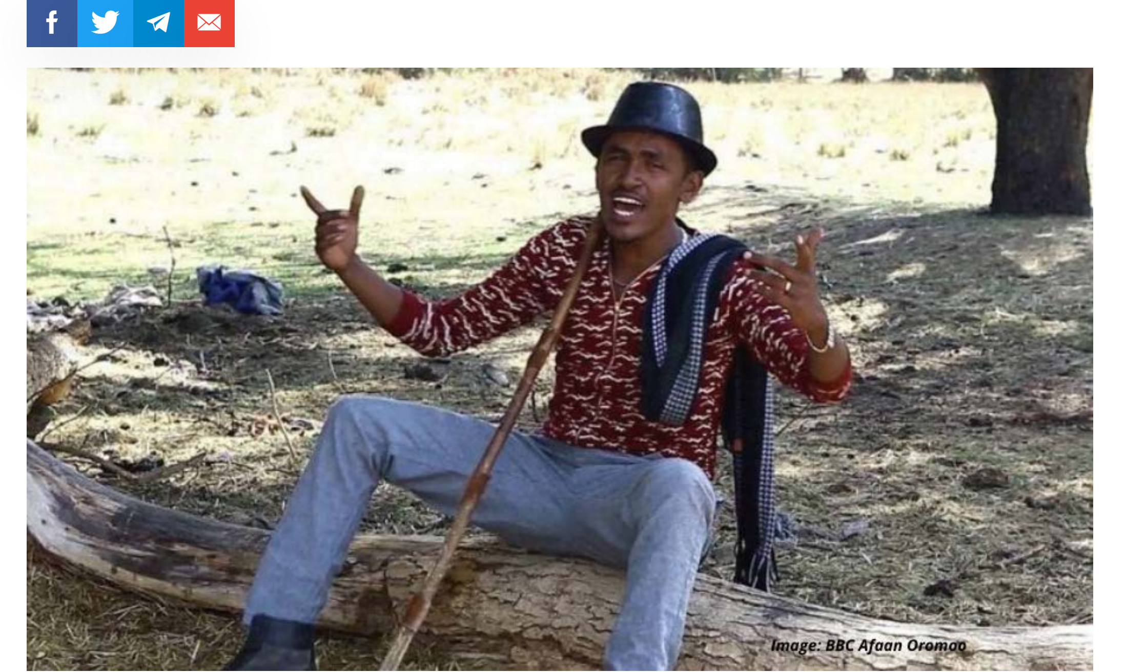
The late artist Haacaaluu Hundeessaa performing his 2015 hit song "Maalan Jira"