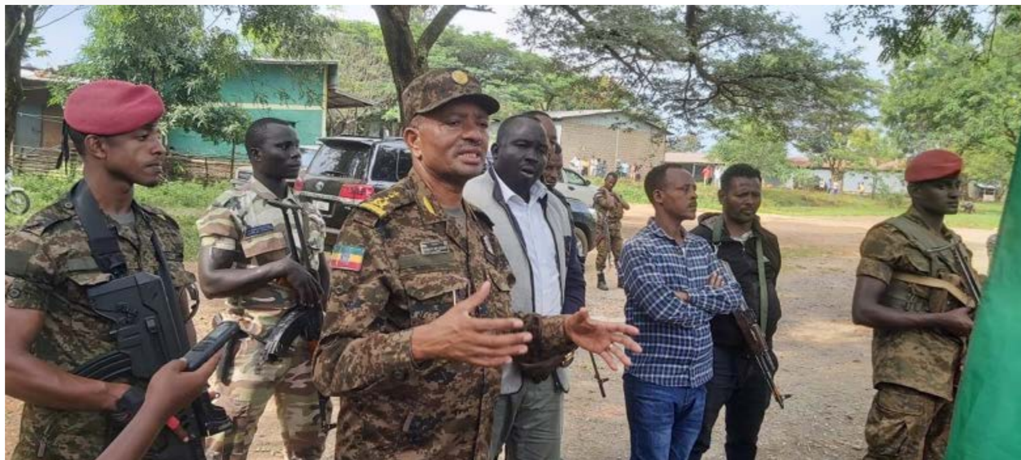
Lt. Gen. Asrat Denero, Commander-in-Chief of the FDRE Ground Forces and Coordinator of the Metekel Zone Integrated Command Post in a meeting with local militia in Pawi Wereda.