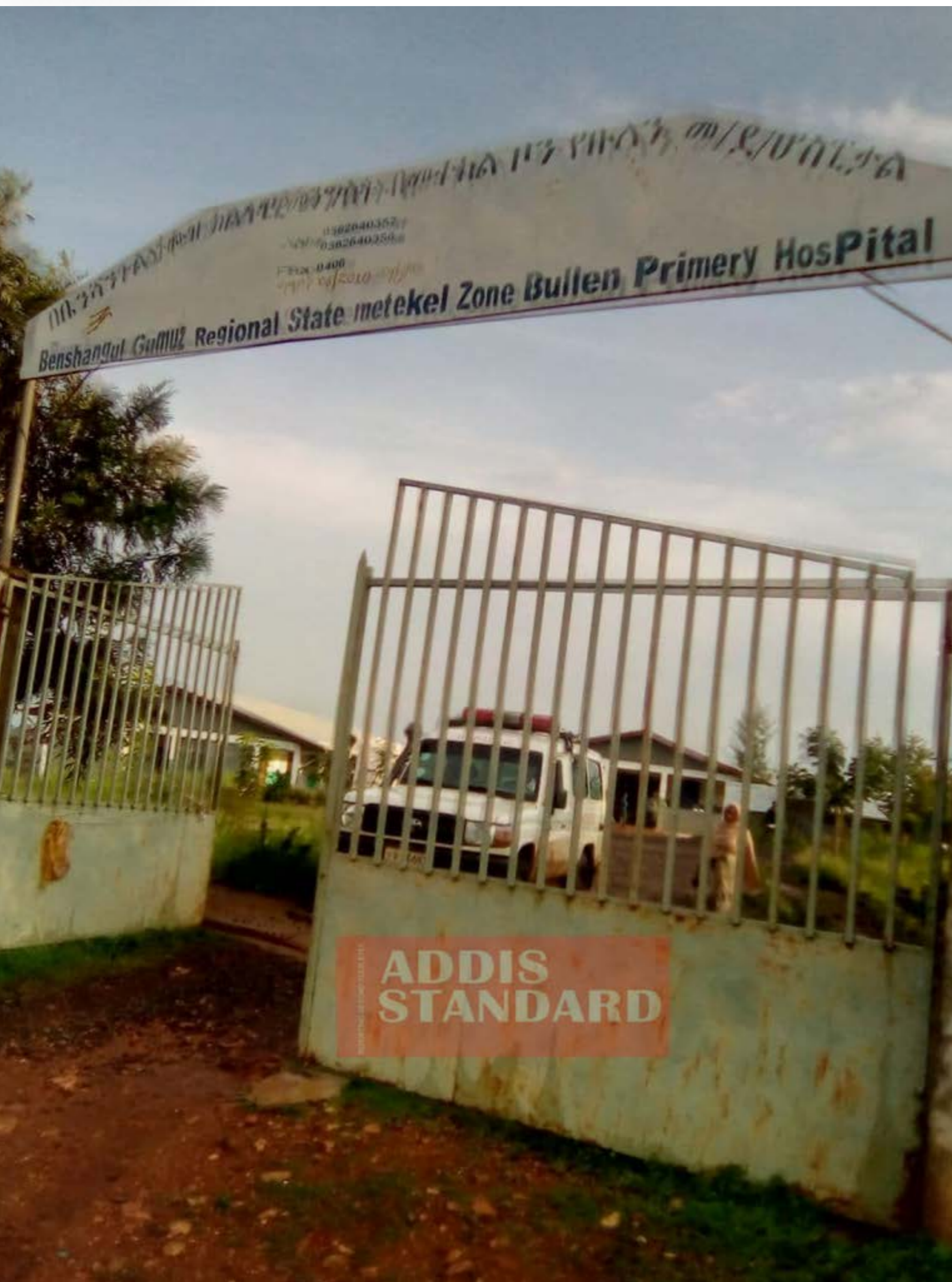
Victims of Saturday's attack were brought to Bulen Primary hospital