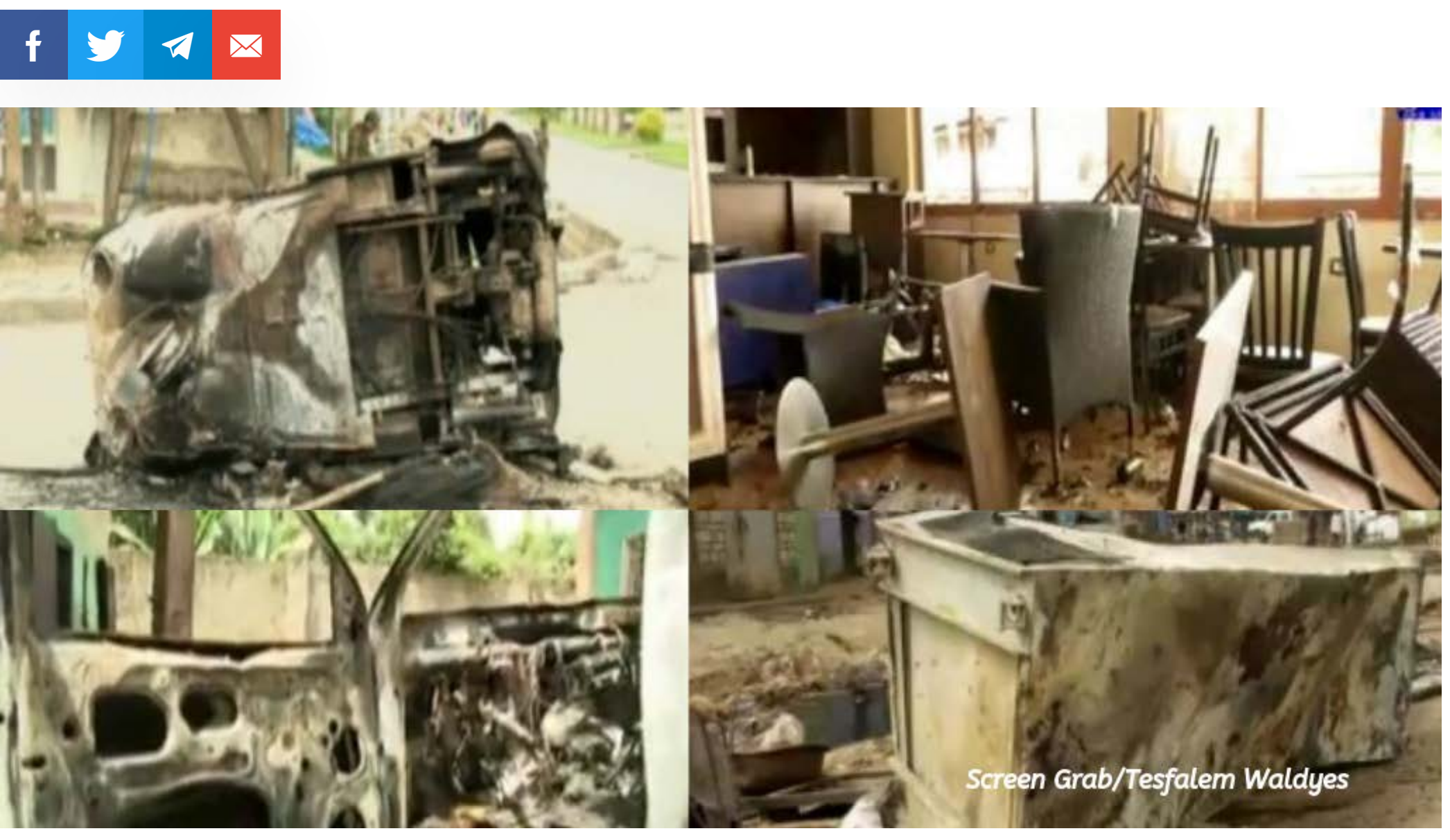
A regional TV, South Radio and Television Agency, showed burned cares, shops, bars and restaurants in Aleta Wendo town during its news hour last night. It also featured distraught civilians who have lost their belongings.