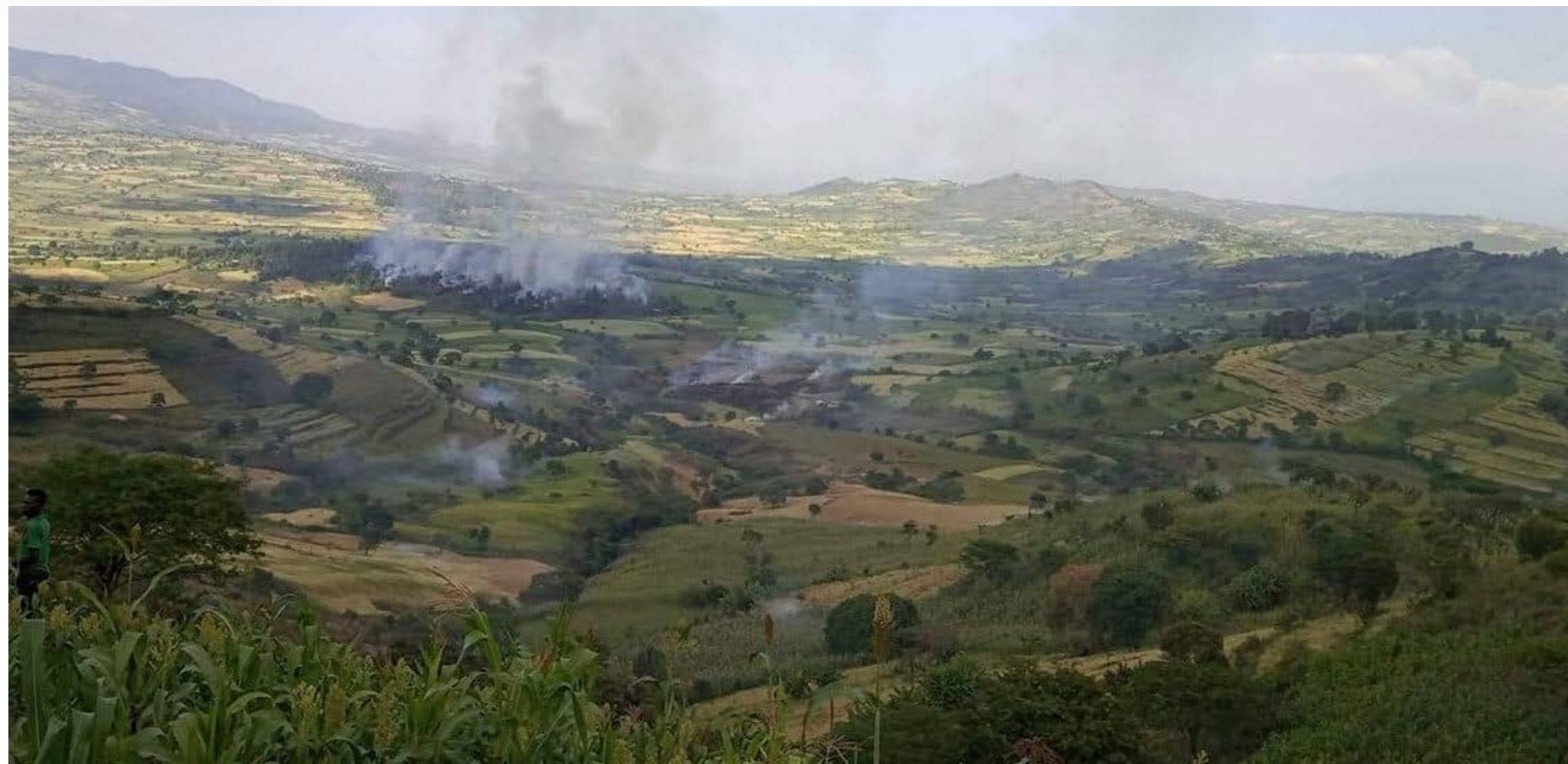
Villages located in various localities of Konso zone in SNNPRS are often targeted.