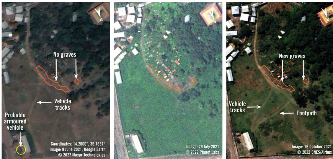
Satellite imagery from 9 June, 29 July and 19 October 2021, shows the St. George’s Church graveyard area in Kobo, Ethiopia. On 19 October 2021, many new graves are visible that were not apparent in the previous imagery in the exact location where witnesses told Amnesty International they had buried some of the civilians summarily killed on 9 September.

Satellite imagery analysis by Amnesty International’s Crisis Evidence Lab shows evidence consistent with new burial sites at the St George’s and St Michael’s churches compounds, where residents told Amnesty International that they had buried those killed on 9 September.