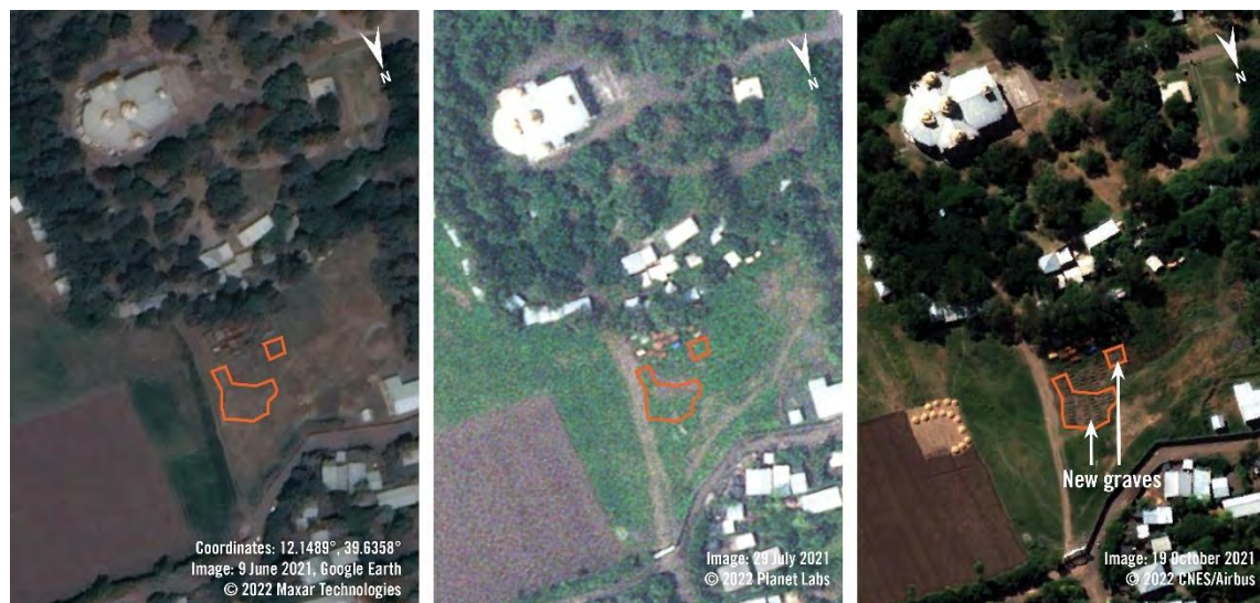
A time series of satellite imagery shows the increase in graves at St. Michael’s church graveyard, where witnesses told Amnesty International some of those summarily killed on 9 September were buried. On 9 June 2021, new graves are not visible. On 29 July 2021, imagery shows a small area of possible disturbed earth but it is not clear if they are graves. On 19 October 2021, imagery clearly shows an increase in graves.