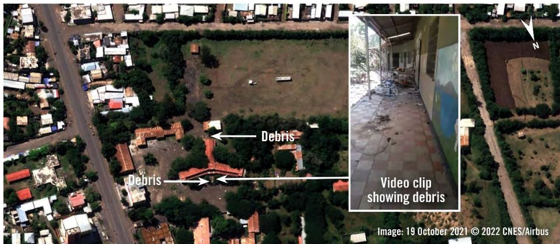
Satellite imagery from 9 June and 19 October 2021 shows St. Joseph’s School. On 19 October 2021, small areas of debris are visible consistent with a video showing areas of the school ransacked and with residents’ testimonies. The debris may have been present on 29 July, but the resolution of the image is not high enough to see the subtle debris. Video source: Uploaded 14 December 2021, https://www.facebook.com/watch/?v=598507934537401 , accessed 4 February 2022. (The 9 June image shows the presence of many lorries, buses and military trucks, indicating the presence of government forces and/or allied militias around the school prior to the arrival of Tigrayan forces in Kobo. Government forces were also using the school in early February 2022 according to witnesses).