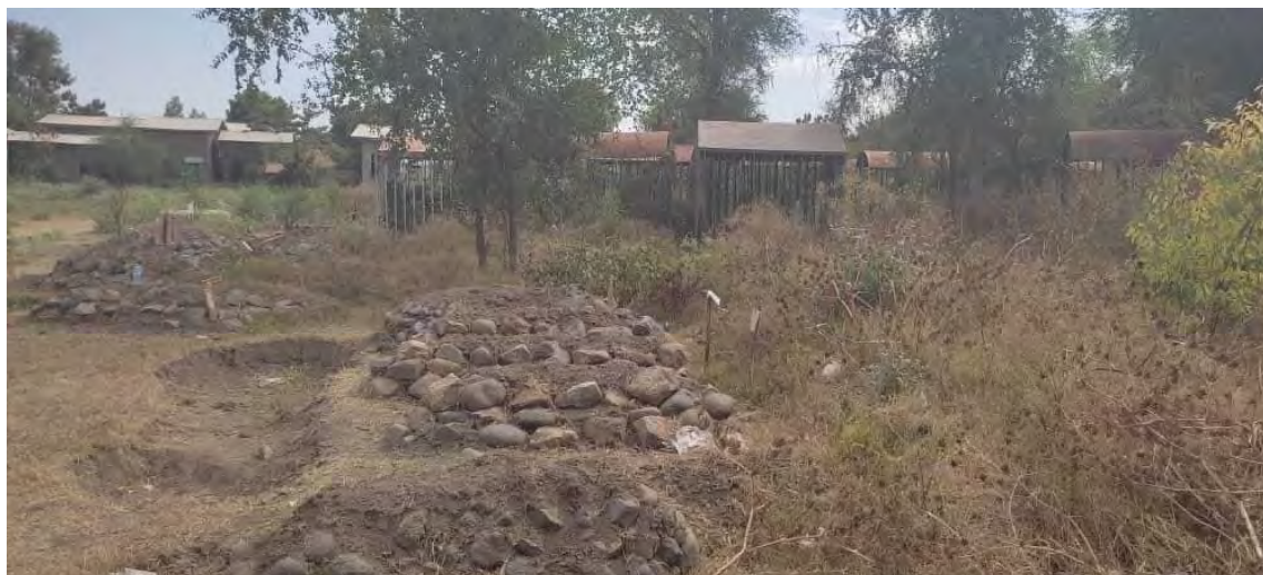
New graves in the St. George's Church graveyard in Kobo, Ethiopia, where witnesses and survivors told Amnesty International that they buried those summarily killed by Tigrayan forces on 9 September 2021.

At first when we wanted to bury the bodies on Friday morning (10 September) the Tigrayan fighters did not allow us. My mother was crying and she told them, "then kill me like you killed my sons," and a fighter kicked her, but then another fighter came by in a 4x4 vehicle and told the others to let us bury the dead. 27