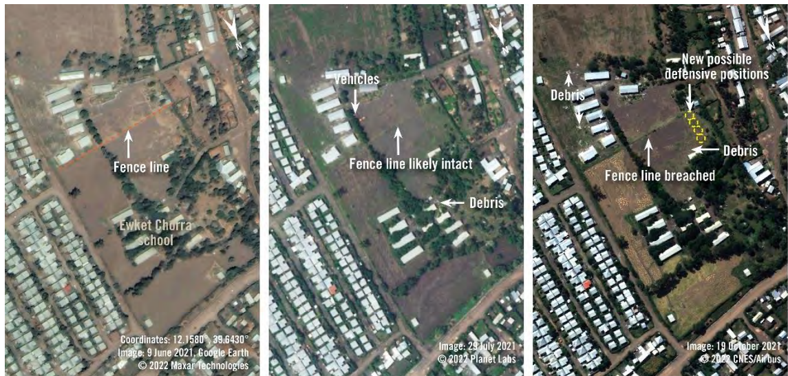
Satellite imagery from 9 June 2021, shows the Ewket Chorra school which according to Kobo residents was used as a military camp by Tigrayan fighters, who also ransacked the school. On 29 July 2021 debris is visible at the entrance to the school. By 19 October 2021, the fence line between the school and the southern compound appears breached. There is new debris throughout both compounds and new possible defensive positions visible on the school side of the fence line. (The school was also used by government forces before and after the presence of Tigrayan forces in Kobo, according to Satellite imagery from November 2020 and to witnesses in early February 2022)