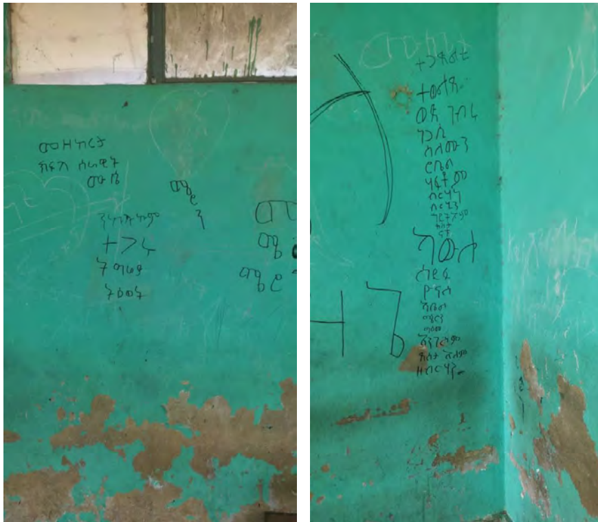
Writing on the wall of the Ewket Chorra school in Kobo, in the Amhara region of Ethiopia, says "Memorial of Moses Division. For all Tigrayans, (Tegaru), Tigray will prevail". The school was being used as a military camp by Tigrayan forces when they controlled the town last year, and was left ransacked and vandalized.