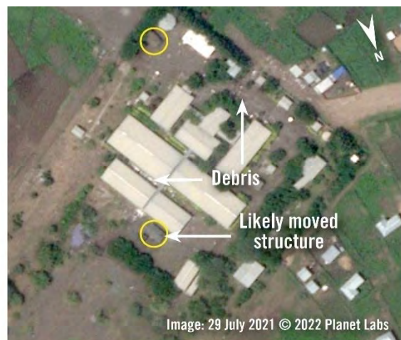
Satellite imagery from 9 June and 29 July 2021 shows the Kobo hospital. On 29 July, debris is visible in the area consistent with reports that the hospital buildings had been ransacked.